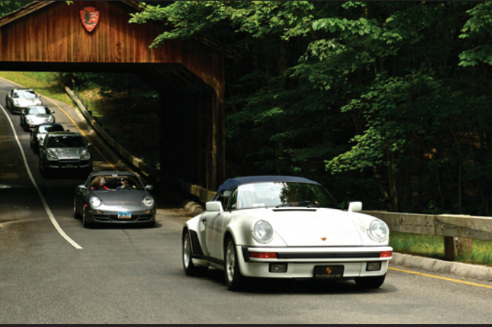
THE PORSCHE CLUB OF AMERICA OFFERS DRIVING EXPERIENCE, TECHNICAL ASSISTANCE AND CAMARADERIE SECOND TO NONE.